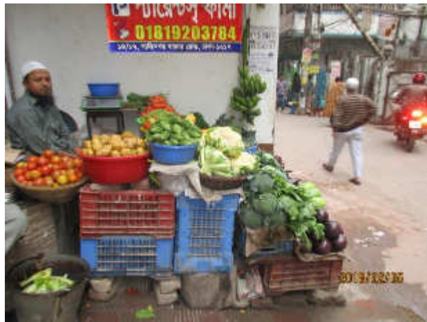
SL# 27, Md. Bashir Ullah, Road # 228, Bazar Road Shantinagar, Dhaka