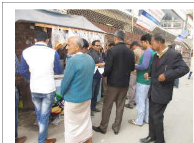
Tea Stall meeting at DMA-615 20.01.2018 at Chamelibag, Shantinagar