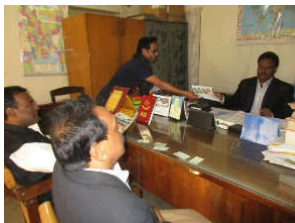
Public Consultation Meeting on 24.01.2018 at Purana Paltan Girls High School