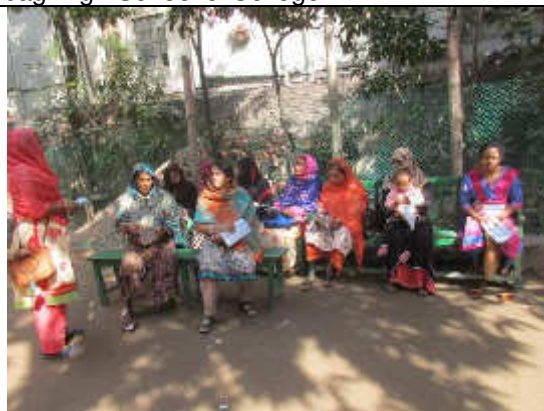
FO Conducting Community Meeting at Shantinagar Area in DMA-615