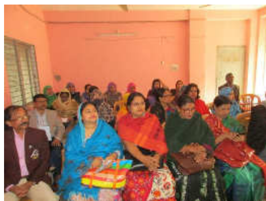
Public Consultation Meeting 01.02.2018 at Arambag High School & College