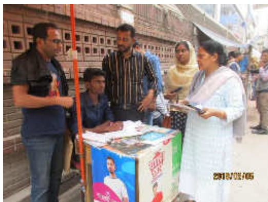
Affected Person Joint Verification on 05.02.2018 at DMA-615 in Shantinagar Area