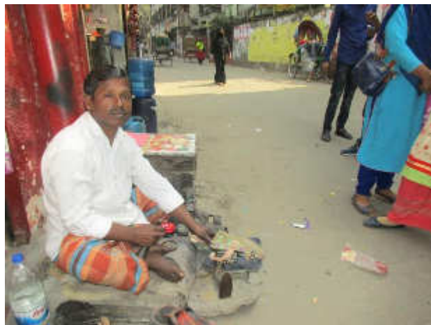
SL# 29, Ropindo, Road # 203, Topkhana Road, Segunbagicha, Dhaka