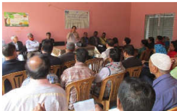
Public Consultation Meeting 01.02.2018 Arambag High School & College